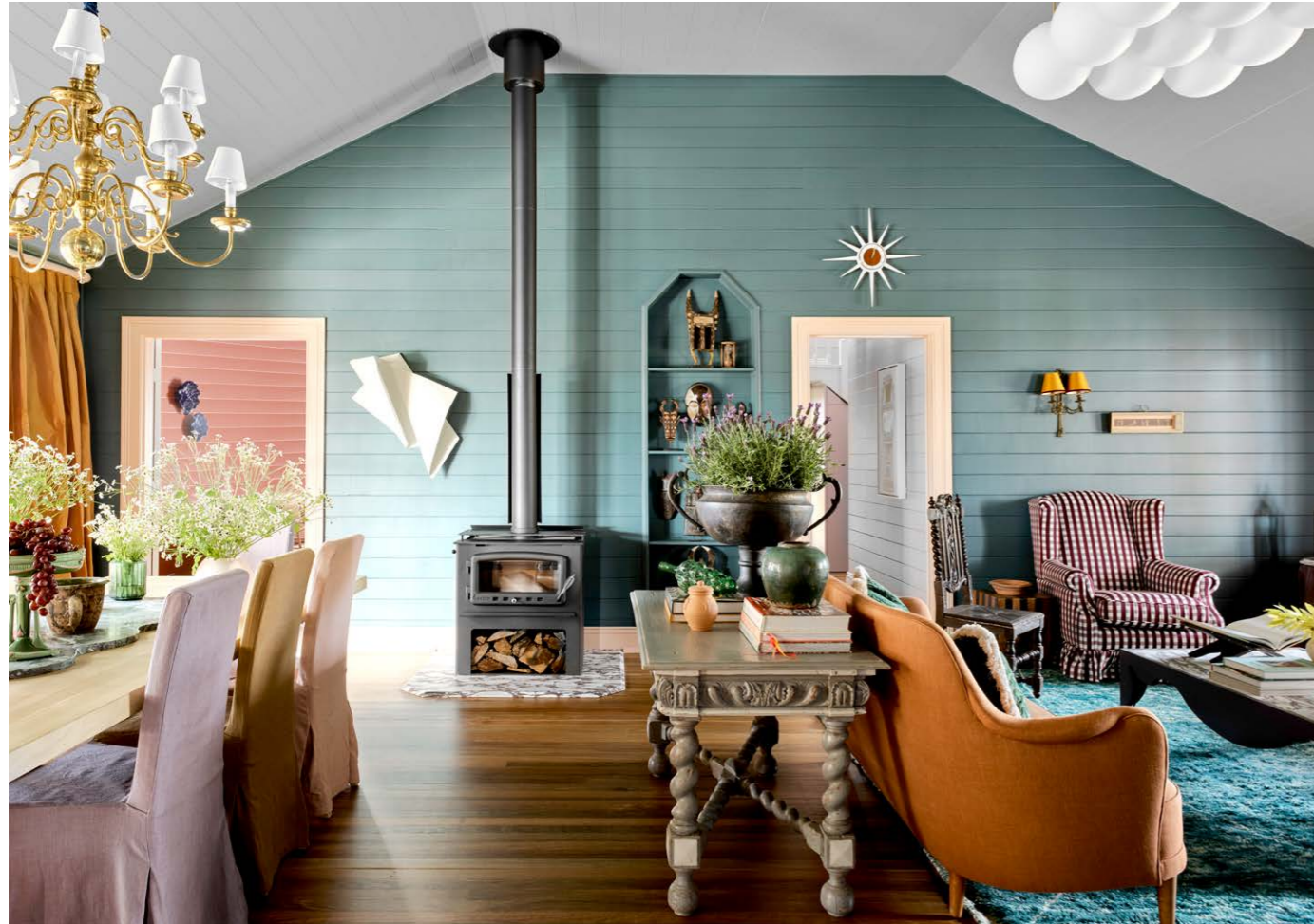
This page, from top In the formal living room is a Nord Modern vintage sofa re-upholstered in 'Lexus Gingerbread' from Warwick, an antique gothic side chair and a vintage armchair upholstered in Schumacher 'Bermuda Check', all on a Berber rug from Kulchi. Duet designed the custom wall light and coffee table and sourced the vintage artwork. Hanging above the lounge area is an oversized pendant light by Duet. A doorway with a vintage starburst clock above leads to the central hallway. A vintage console divides the living and dining areas. 'Big Bakers Oven' fireplace from Nectre. Hanging above the 'Florence' dining table from MCM House is a vintage pendant light with custom shades. Slipcovered dining chairs by Duet. White powder-coated aluminium wall sculpture by The Visuals. Masks on display in the alcove are from Orient House. In the library of the main house, Duet re-upholstered a vintage sofa in The Isle Mill 'Inchture' tweed in Pimento from Tigger Hall Design. Vintage Turkish rug from The Rug Specialist. Statue and bird sculptures from Orient House. Vintage wall light. Vintage chair re-upholstered in Cloth 'Plushous' velvet from Ascraft with red gimp-braid trim. Custom coffee table in Calacatta Viola by Duet with pink vase from Studio ALM. Walls in Dulux 'Autumn Orange', ceiling in Dulux 'Frills' and doors and architraves in Dulux 'Rice Crop'. Roman blinds by Marlow & Finch.