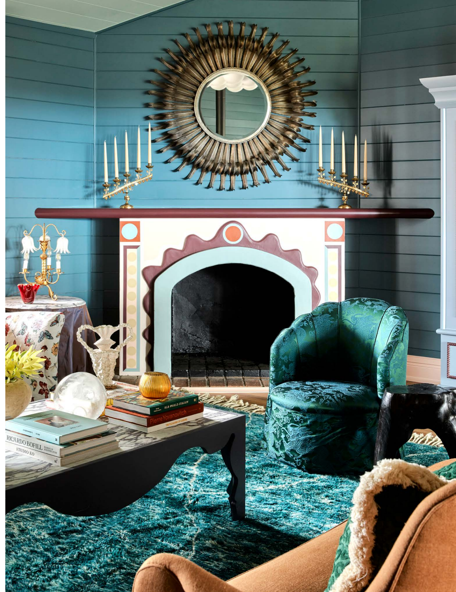
This page The formal living room is wrapped in blue with walls painted in Dulux 'Benang'. The fireplace is original with a custom decorative painting design by Duet. Above is a mirror and pair of candelabras, all vintage. A vintage light sits on a custom side table with silk skirt and Calacatta Viola top by Duet. Armchair re-upholstered in Schumacher 'Ruan Dragon' damask in Emerald. Nord Modern sofa covered in 'Lexus Gingerbread' fabric from Warwick with custom cushions in Schumacher 'Vermicelli Velvet' in Emerald with Inge Holst brush trim in Natural. Calacatta Viola-topped coffee table by Duet. The glass sphere is vintage and the vessel is by Hilary Green. Berber rug from Kulchi.