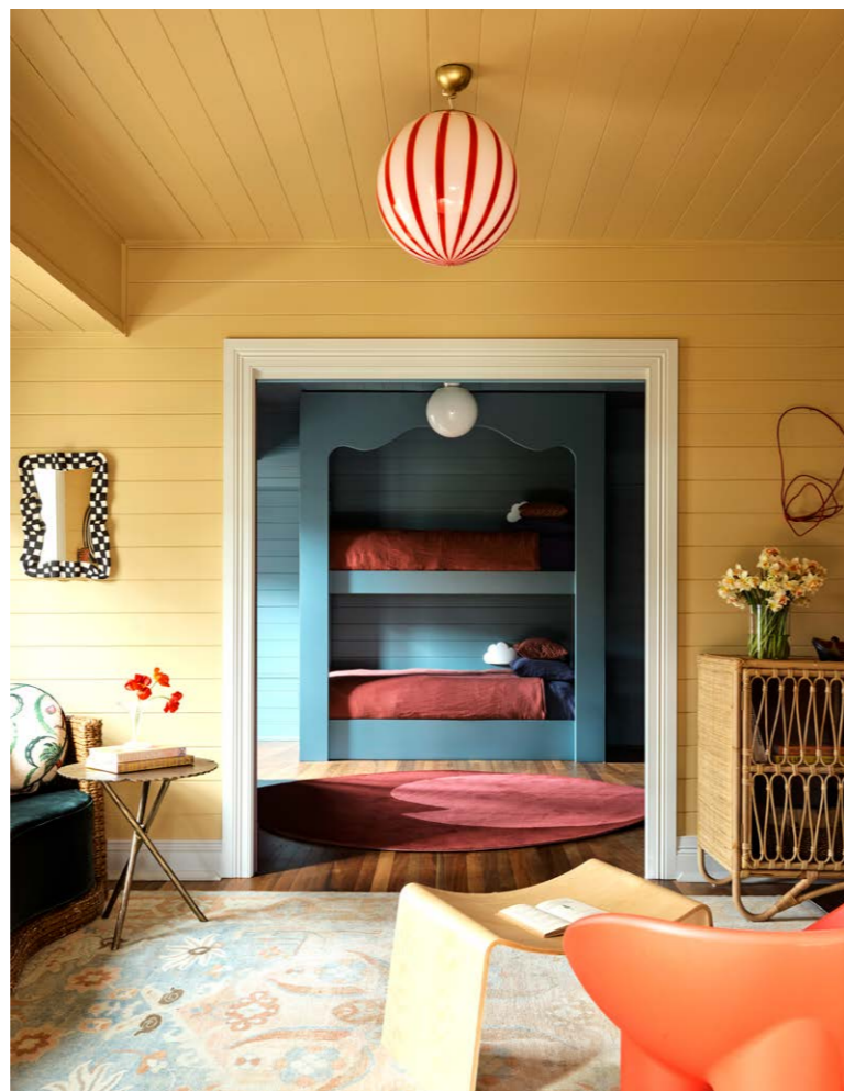
This page The bathroom in the loft suite is open plan with views out to a magnolia tree and the ocean. Demarcating the bath from the sleeping area is a small platform of Calacatta Viola from Granite & Marble Works on the floor. Victoria & Albert ‘Richmond’ bath with Astra Walker ‘Olde English’ floor-mounted mixer and hand shower in aged brass. Beside the bath is a ‘Verona Palazzo’ side table from GlobeWest with Guaxs vase from Conley & Co. The walls are painted in Dulux ‘Soft Impala’, the ceiling in Dulux ‘Soft Impala Half’ and architraves in ‘Benang’. Vintage pendant light. Opposite page, clockwise from top left In the main house bathroom the joinery in Dulux ‘Deep Arctic’ features ‘Trader’ pulls from The Society Inc. Astra Walker ‘Olde English’ wall tap set. Benchtap in Brescia Capria Royal from J&L Marble. Cycladic sculpture from Mercer & Lewis. Vintage mirror and sconce. The main house loft suite was designed to be a romantic bolthole with a custom four-poster bed painted in Dulux ‘Celtic Rush’ with bed linen from Cultiver and a Society Limonta throw from Ondene. Brass concertina lamps from Matilda Goad. Vintage wall sconces. The casual living room in the main house is adjacent to the bunkhouse. The contemporary Faye Toogood ‘Roly Poly’ chair in Brick is from Hub and the ‘Gus’ wave stool from GlobeWest. ‘Jessie’ rattan cabinet from Abide Interiors. ‘Asteria’ side table from Koala Living. On walls, custom chequered mirror and sculpture from Cotton Collective. Vintage red and white pendant light. Walls in Dulux ‘Cobbler’ and architraves in ‘Spanish Olive’. Bunkhouse walls in Dulux ‘Tamas’. Custom-made beds paired with wall lights from Ikea. Jordan ‘Airo’ linen in Apple Butter and InBed linen in Midnight Blue. ‘Summit 12’ pendant light by Cedar & Moss. Custom rug by Duet.

When completed, Greyleigh will have a barn, kitchen shed, cabana, pool, chicken coop, workshop for artists-in-residence and a network of cottages and silos. Currently, though, it’s occupied full-time by ponies, llamas, sheep and sprightly chickens. “It was a whopper job,” says Dominique. “And there’s so much more to come.” greyleigh.com.au ; weareduet.com.au