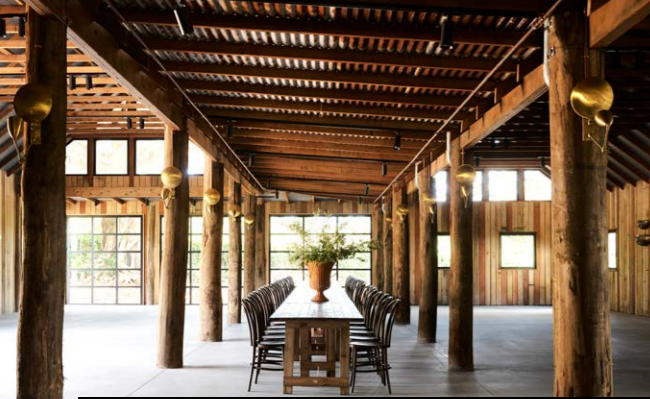
This page, from top Trestle table from Rustic Living Plus and existing walnut finish bentwood chairs. Brass wall lights from Ranor Lighting Design. 'Levante' woven basket on table from Mercer & Lewis. At The Gables bar Thonet bar stools, 'Pascal' lamp from CLO Studios, bowl and tray from Orient House, and French earthenware pots from Parterre. In the lounge silo, custom stone coffee table by Duet, 'Shapely' stool and 'Form Three' chair from Worn Store. Armchair from MCM House. Custom moon-phases ceiling motif and in-situ concrete bench seat design by Duet, 'Ghost' wall sconces from Light Cookie. 'Emin' seagrass cushions from Inartisan on custom concrete bench seat by Studio Rewild in collaboration with Emily Simpson Landscape Architecture.